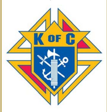
In Service to One. In Service to All

Knights of Co1umbus 180 S. Russell Ave Aurora, IL 60506